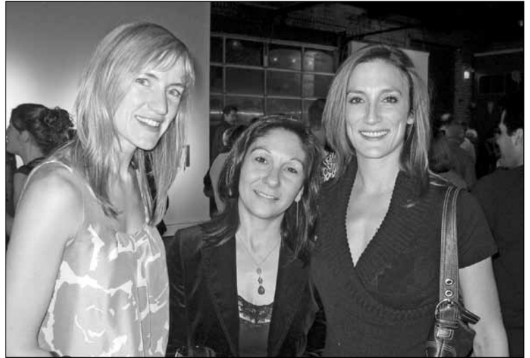
Art Fix 2008: Partygoers enjoyed local art and tastings from such Baileys' Chocolate Bar, SqWires, Butler's Pantry and Square One Brewery.

More information and tickets are available online at artfixstl.com or by calling 314.918.9918 ext. 21.