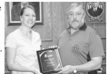
Sheet Metal Workers Local 36 accepts the award

The Glaziers did such work as repairing windows that many of the most skilled handyman would not have been able to do. The Sheet Metal Workers not only donated of their time to fix many heating, cooling, and gutter problems, but also donated several new air conditioning units. The Plumbers and Pipefitters have worked tirelessly to replace fixtures and plumbing in an astonishing number of homes. The Electrical Workers Union replaces light switches, receptacles, light fixtures, and even main electrical panels. Without these men and