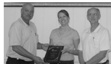
Glaziers Local 513 accepts the award

women there would still be broken windows, leaky plumbing, non-functioning heating and air conditioning units, electrical hazards, and a number of other hazards in homes across the St. Louis area. They have shown themselves to truly be caring members of the St. Louis area by giving of themselves to help strangers.